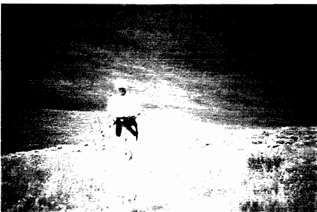
Figure 3 —Radio-tracking sage-grouse in high-elevation summer range with a stand of mountain big sagebrush in the background.

Fall (late September into early December) is a time of change for sage-grouse from being in groups of hens with chicks or males and unsuccessful brood hens to separation