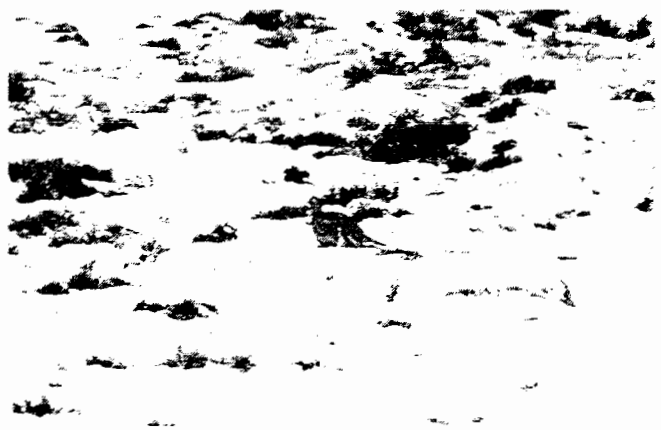
Figure 4 —Sage-grouse winter range in Wyoming big sagebrush habitat in North Park, Colorado.