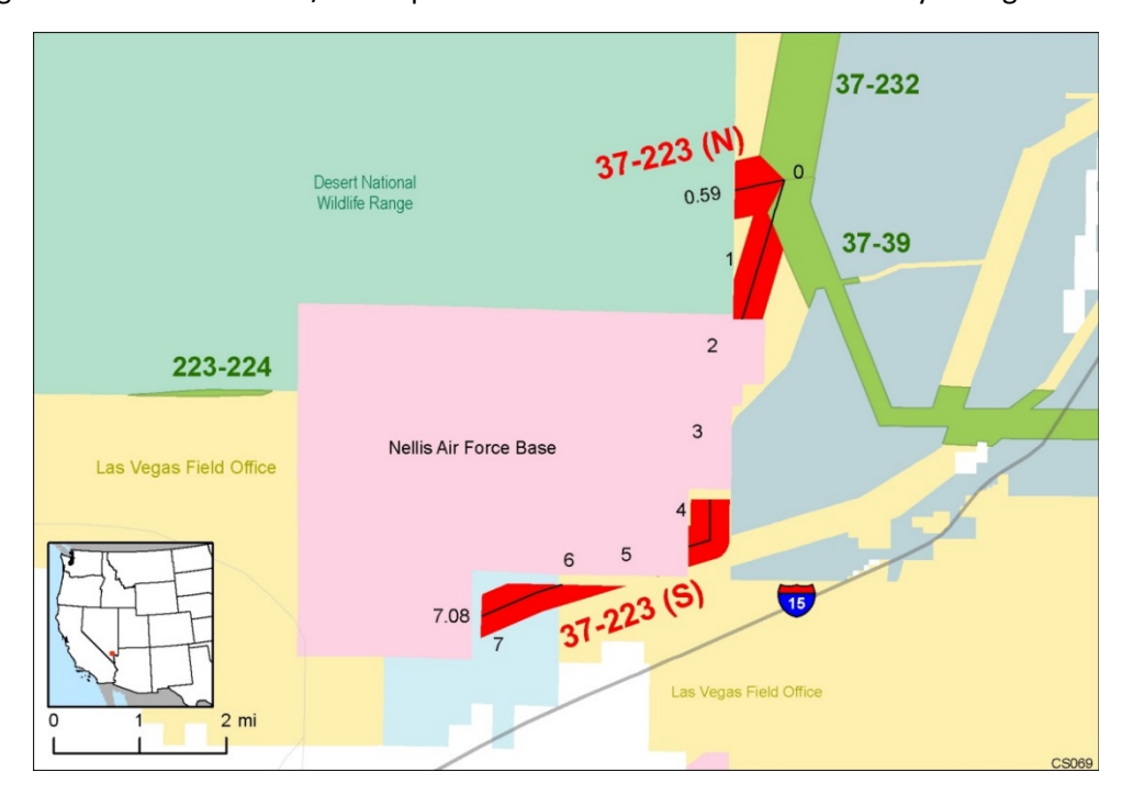
Figure 1. Corridor 37-223

Corridor 37-223(S) begins just east of the southeast corner of the Desert National Wildlife Range in southern Nevada, at the junction of Corridors 37-232 and 37-39 and extends 7.1 miles to the south and west. Federally designated portions of this corridor are entirely on BLM-administered land, with a 2,400-ft width over its entire length. It is designated as an underground-only corridor due to military training requirements. The corridor spans 7.1-miles, with 3.4 miles designated on BLM-administered lands. The designated area is 817 acres/1.28 square miles. This corridor is also entirely in Region 1.