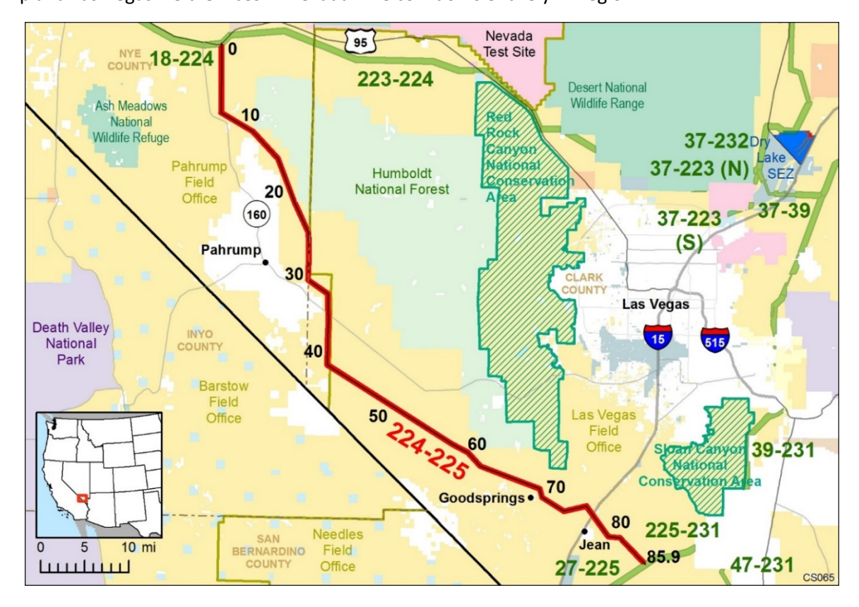
Figure 1. Corridor 224-225

Corridor 224-225 (Figures 1 and 2) extends northwest to southeast along the southwest border of Nevada, beginning at the junction of Corridors 18-224 and 223-224 along U.S. Highway 95 in Nye County, to the junction of Corridors 27-225 and 225-231, approximately 7 miles southeast of Jean in Clark County, Nevada. Federally designated portions of this corridor are entirely on BLM-administered lands, with a 3,500-ft width throughout. Corridor 224-225 is designated as multimodal and can therefore accommodate both electrical transmission and pipeline projects, and it was not established as a corridor prior to its designation as a Section 368 energy corridor. The corridor spans 85.9 miles distance, and since there are no undesignated gaps within the corridor, the corridor also has 85.9 miles designated on BLM-administered lands. The corridor's area is 36,236 acres or 56.6 square miles. The corridor is under the jurisdiction of the Southern Nevada District and the Pahrump and Las Vegas Field Offices in Nevada. The corridor is entirely in Region 1.